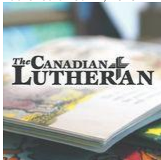
The Canadian Lutheran

(To open hold down Ctrl and click to follow the link)