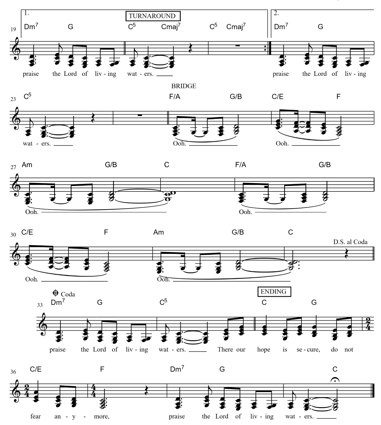
Living Waters - 2