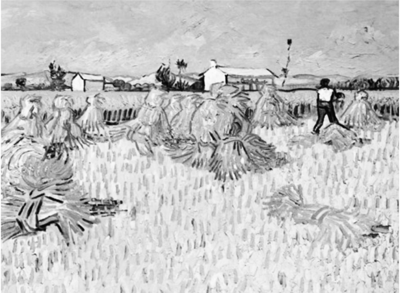
“The Harvest” -- Vincent Van Gogh -- 1888