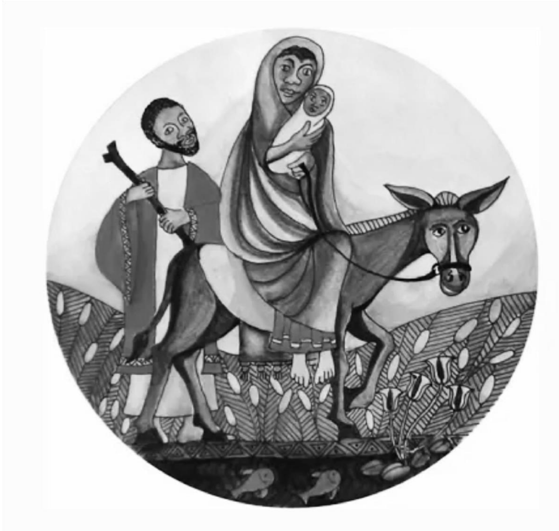
**Jesus' Escaping into Egypt**