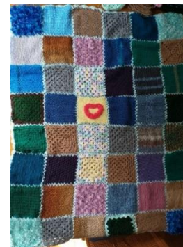
Caring Squares Blanket #3 ↗